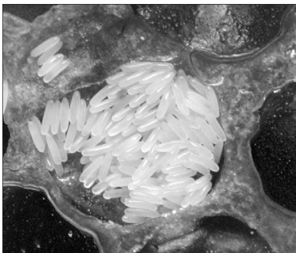
Figure 2. Hive beetle egg clusters in a pollen cell.

in tiny cracks and crevices (smaller than 1 millimeter) throughout the hive and in the brood combs. In the latter case, a female will hide her egg mass in capped brood cells by entering an adjacent empty cell and chewing a hole through the shared wall. She then will insert her ovipositor and lay a mass of eggs (typically 5–10) next to or beneath the pupating bee. If the eggs are not removed by hygienic bees, they will hatch in 24–48 hours and the beetle larvae will immediately begin feeding on the bee pupa. Females can also pierce the cell caps or oviposit in pollen cells ( Figure 2 ).