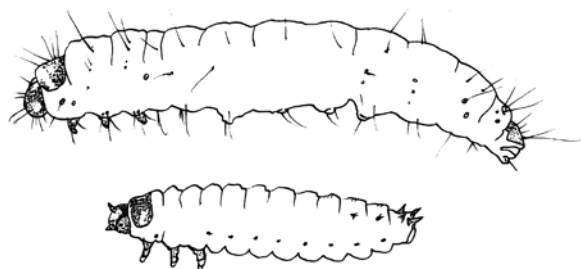
Figure 3. Size difference in wax moth (top) and hive beetle (bottom) larvae.

Larvae undergo four instars—or growth stages—over a period of about a week. A mature SHB larva is considerably smaller than a full-grown wax moth larva ( Figure 3 ), and SHB larvae never produce webbing. A good rule of thumb for distinguishing between wax moths and SHB larvae is, “if you can easily squish it between thumb and forefinger, it’s a wax moth; if not, it’s a hive beetle.” Wax moths and SHB can infest the same hive at once, so be certain you know the difference between these pests.